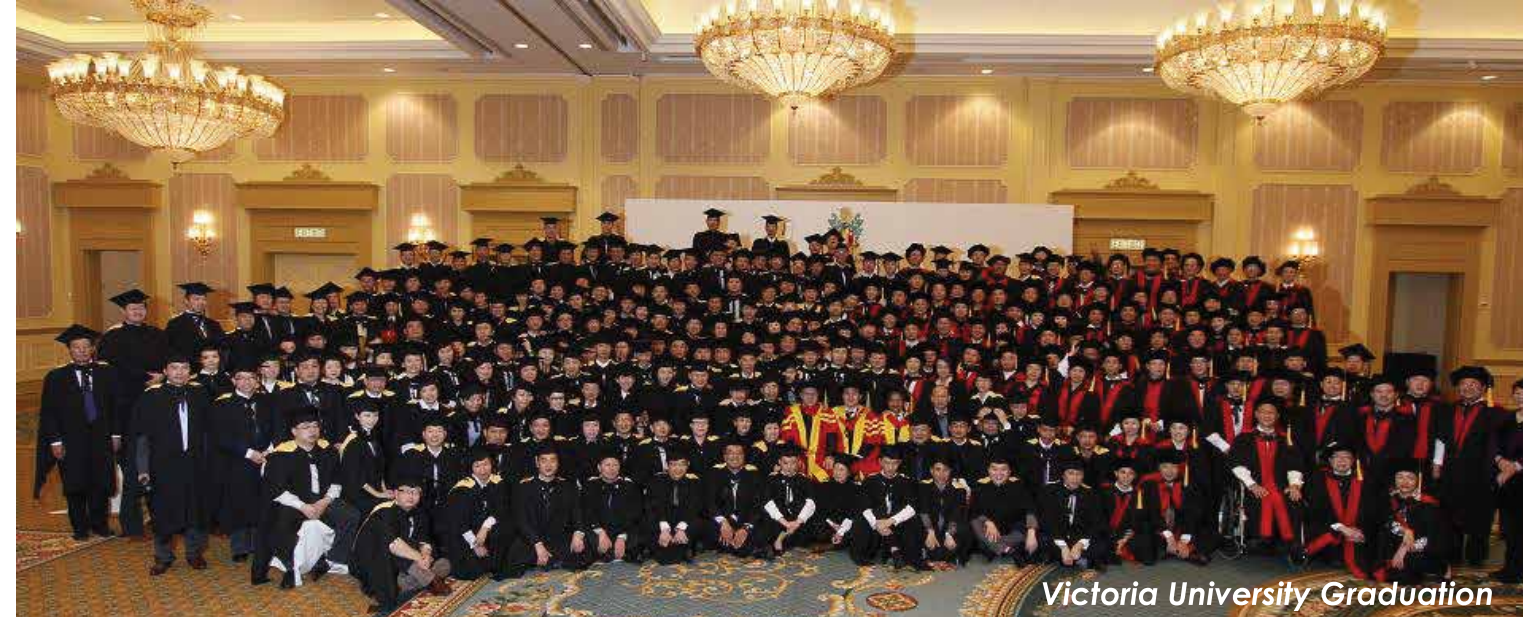
Victoria University Graduation